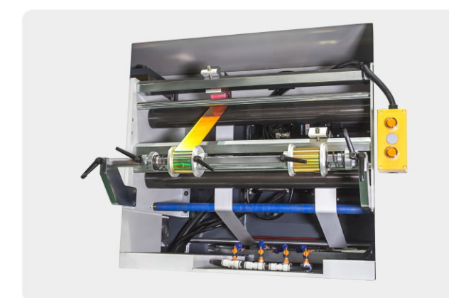
▲ Transversal foil stamping