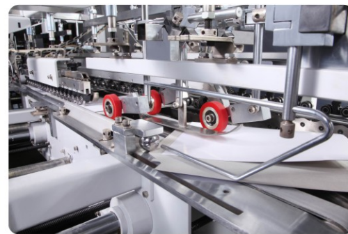
▲ Optional: Bump&Turn system